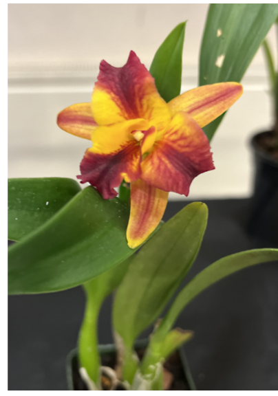
Volkertara Juan Yi Delight 'orchid'