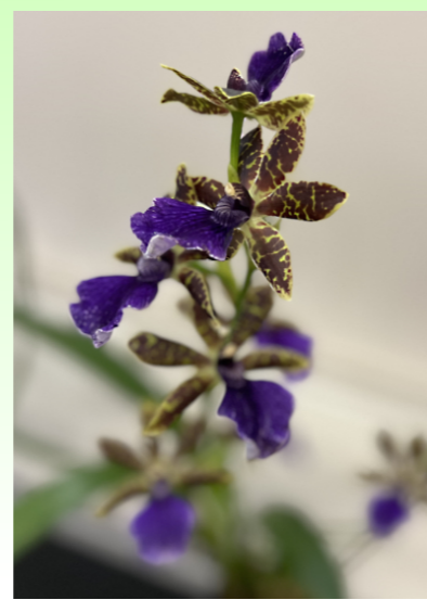
Zygopetalum NOID - 29pts Pat Bussy