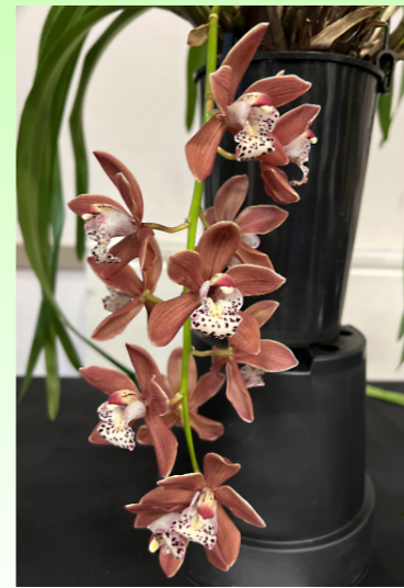
Cymbidium NOID - 29pts Steve Wade