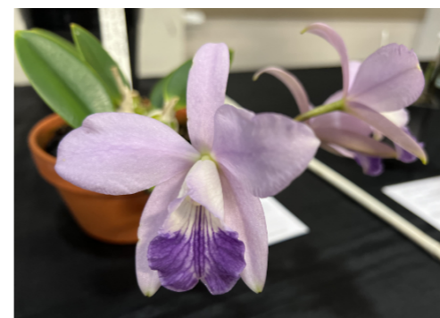
Laelia/Cattleya "Love Knot" - 33pts Pat Bussy