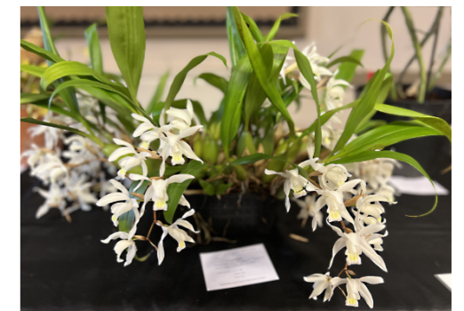
Coelogyne mossiae "Mendenhall" - 35pts Pat Bussy