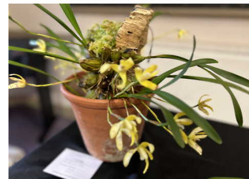
Maxillaria picta - 35pts Pat Bussy