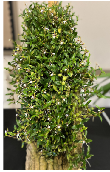
Dinema polybulbon - 36pts Malcolm Moodie