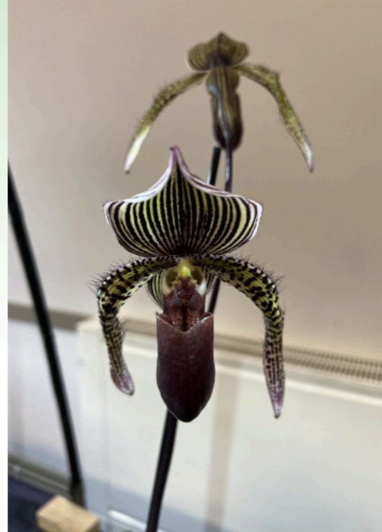
Paphiopedilum Katja Kastrup 36pts Malcolm Moodie