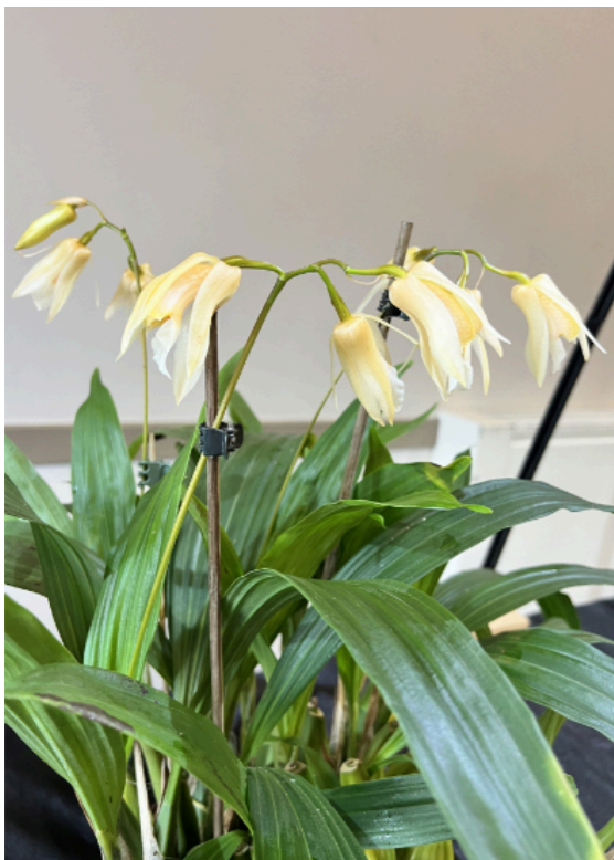
Coelogyne marrelii 27pts Pat Bussy