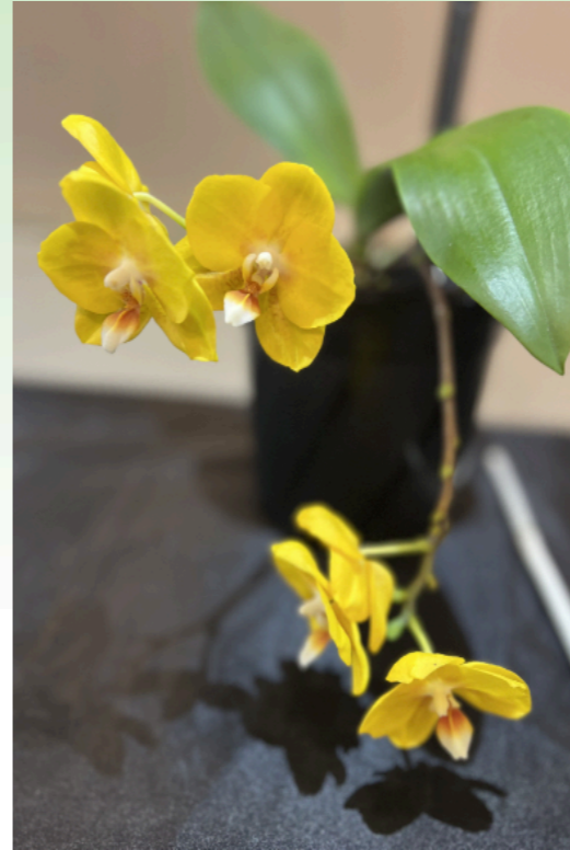
Phalaenopsis hybrid 27pts Pat Bussy