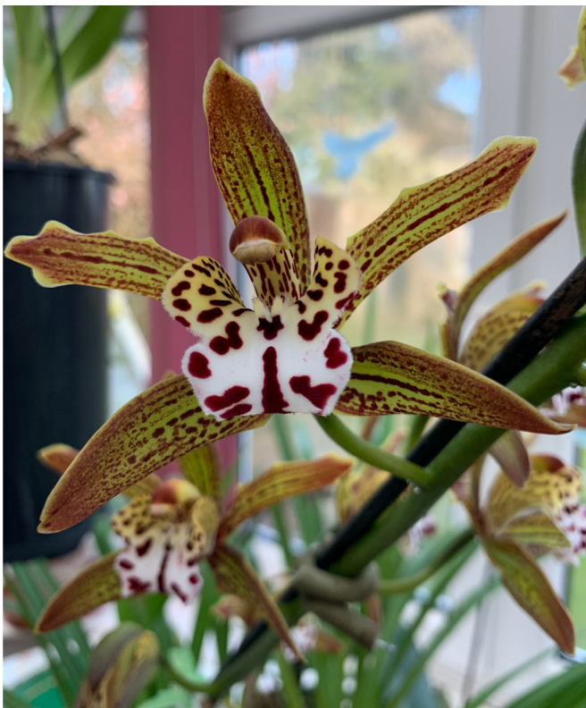
Cymbidium Magic Chocolate