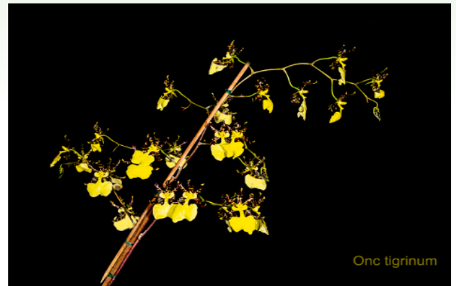
Oncidium tigrinum - 26pts M. Moodie