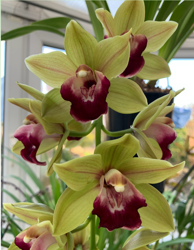
Cymbidium unknown hybrid