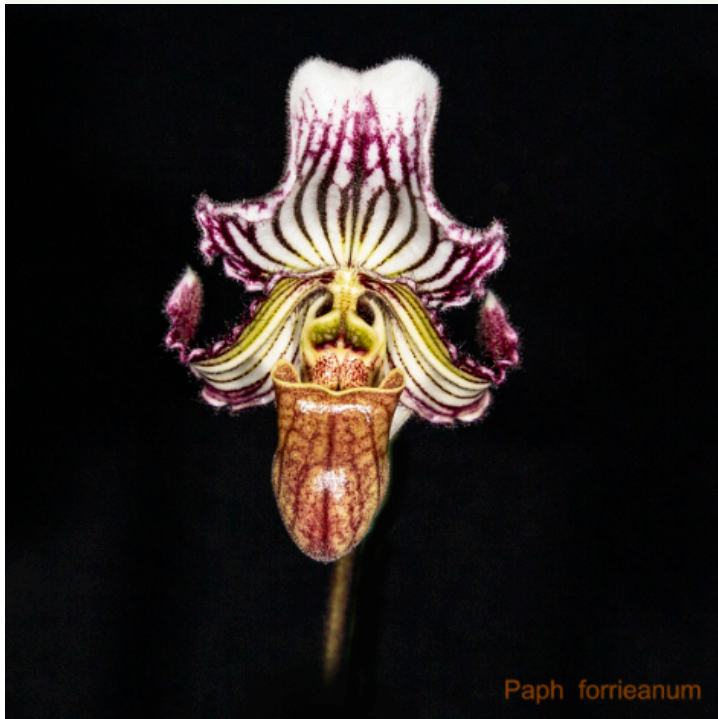
Paph. forrieianum 25pts - M. Moodie