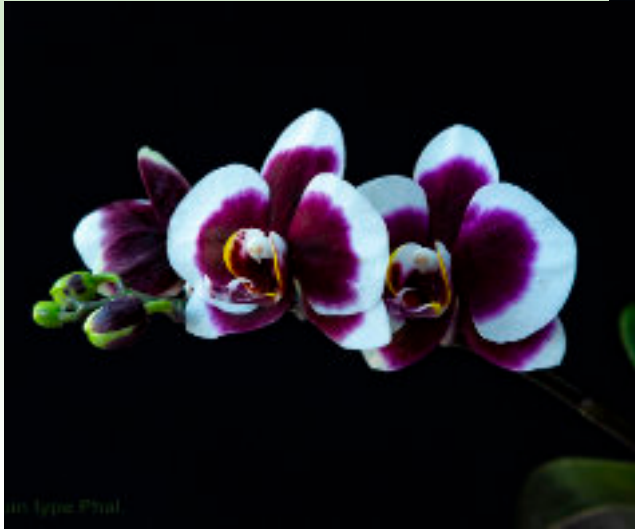
Phal Harlequin type