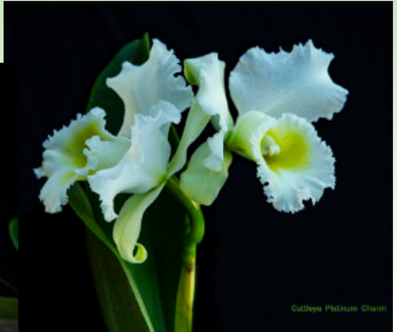
Cattleya Platinum Charm