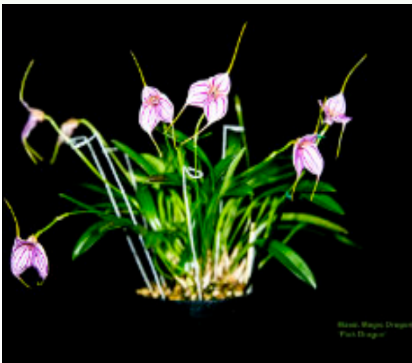
Masd Magic Dragon Pink Dragon