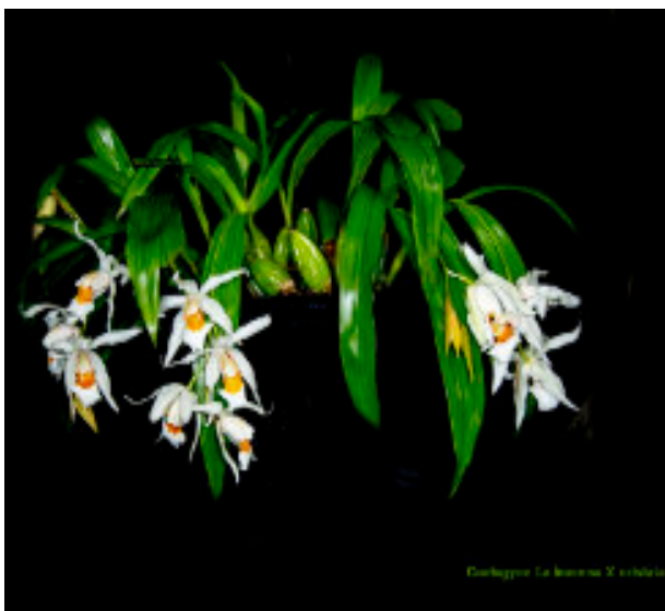
Coelogyne Pat Bussy X orchid