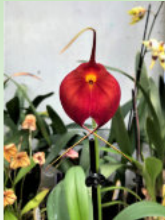
Masd. Chinese New Year AM AOS