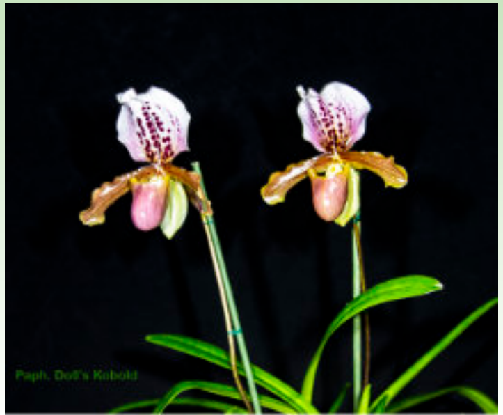
Paph. Doll's Kobold