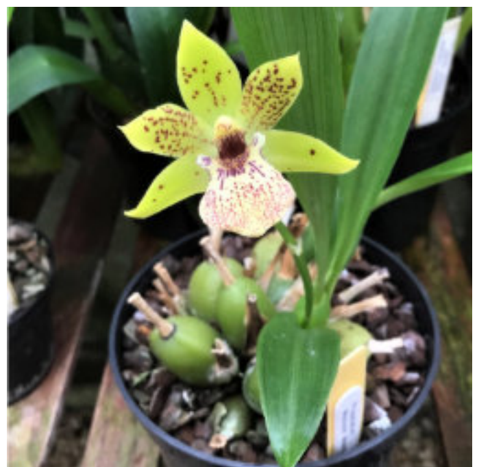
Propetalum Malcolm Moodie