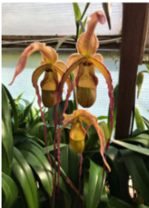
Phrag. Grande La Tuilerie