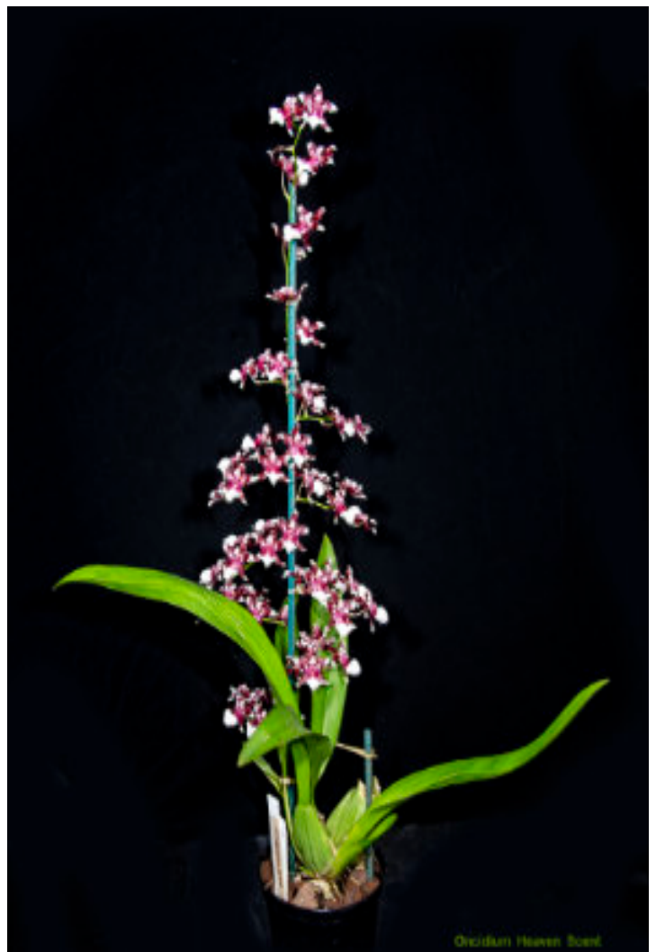
Oncidium Heaven Scent