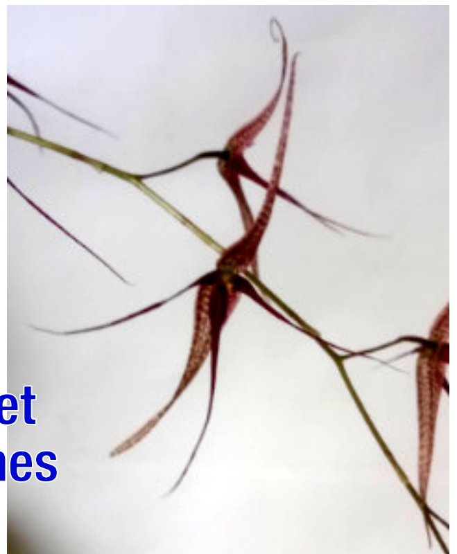
Flower's on one of my Pleurothallis, a species with no name.