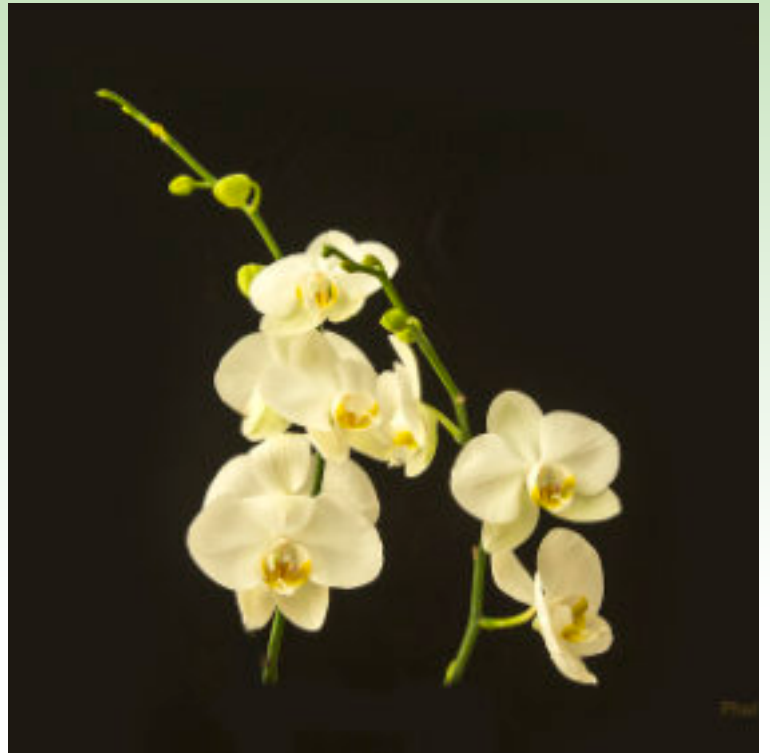
Phal. 'Dame Blanche'