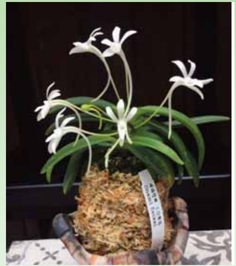
Neofinetia/Vanda Onami Seikai