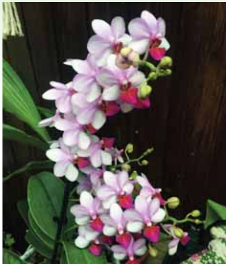
Phalaenopsis Liu's Berry