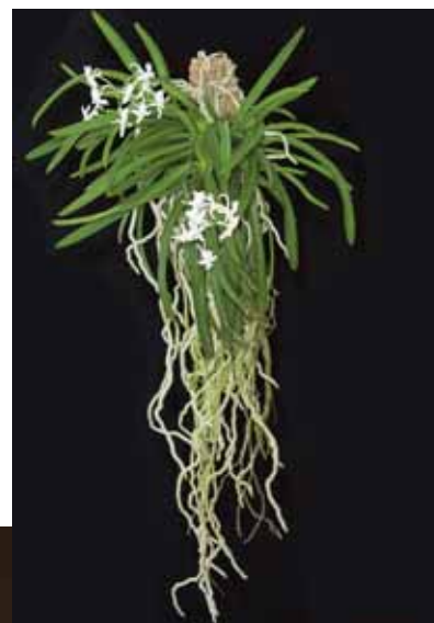
Neostylis Lol Sneary