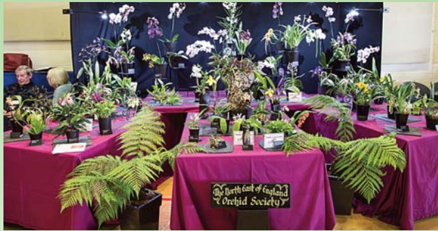
North of England OS