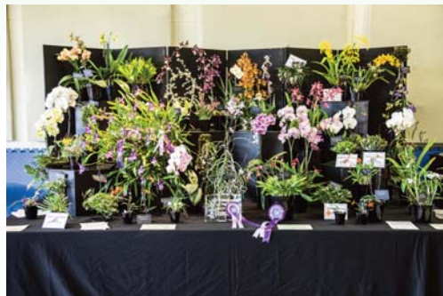
Darlington & District OS