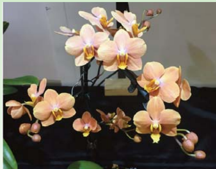
Asconopsis 'Irene Dobkin' Orange - 30pts - Stan Taylor