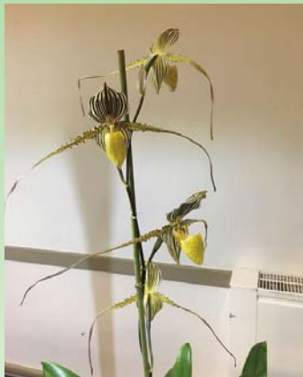
Phragmipedium St. Swithin - 31pts - Malcolm Moodie