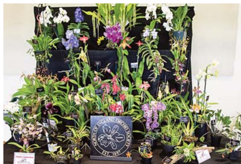
North of England OS