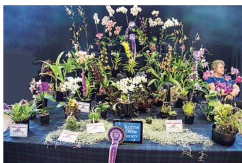
Scottish OS Best Display