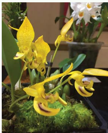
Bulbophyllum deasii - 33pts - Pat Bussy