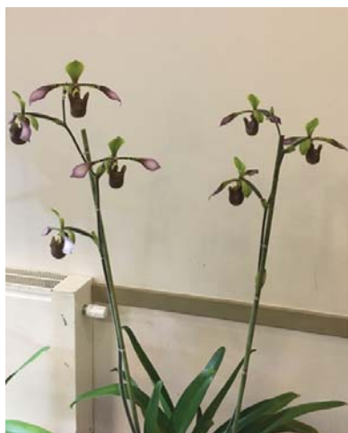
Phragmipedium lowii 'Doll' - 34pts - Malcolm Moodie