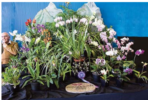
Hinckley & District OS