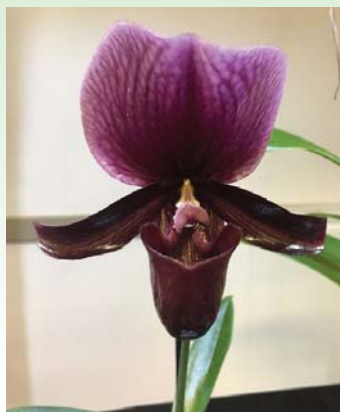
Paphiopedilum Schaetzen - 28pts - Malcolm Moodie