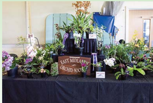
East Midlands OS