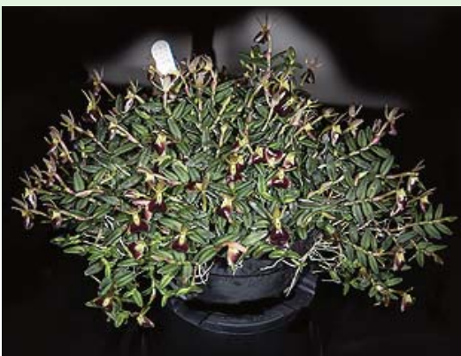
Epidendrum peperomia - Malcolm Moodie