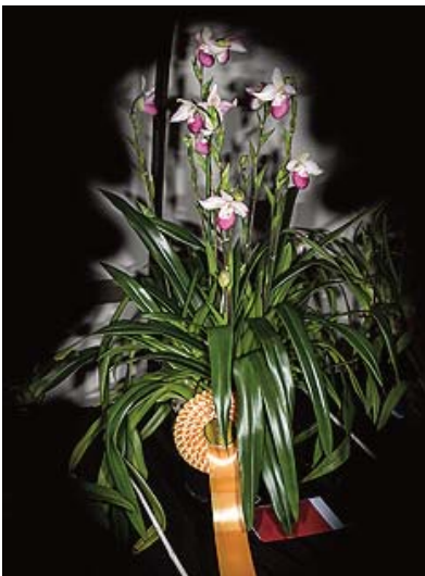
Phrag. schlimii Birchwood - Malcolm Moodie