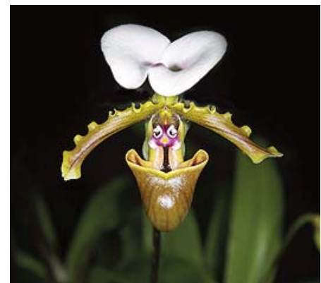
Paph. spicerianum - Malcolm Moodie