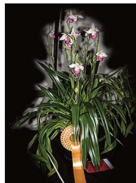
Phragmipedium schlimii Birchwood AM/AOS