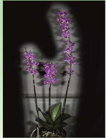
Dtps. Apoya - Malcolm Moodie