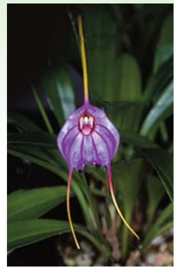
Masd. - Malcolm Moodie