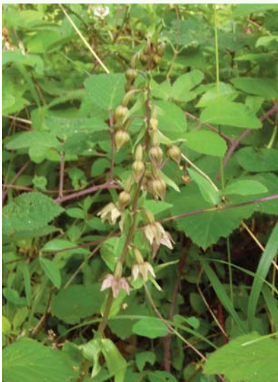
Broadleaved Helleborines at Snitterfield