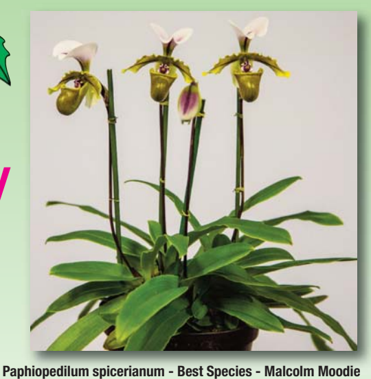
Awarded CCC and Best in Show