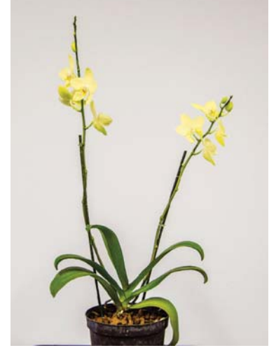
Phal. Sogo key - Malcolm Moodie