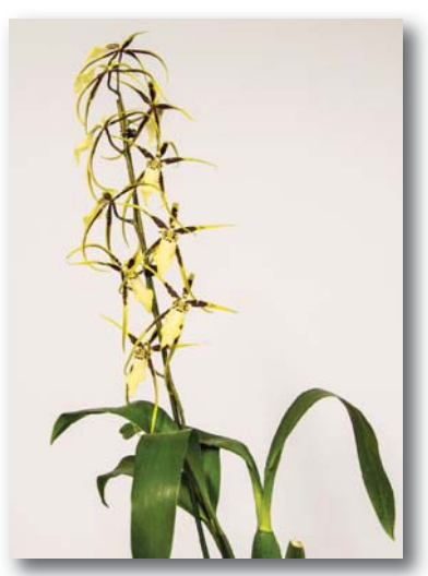
Brassia Eternal Wind - Pam Eden