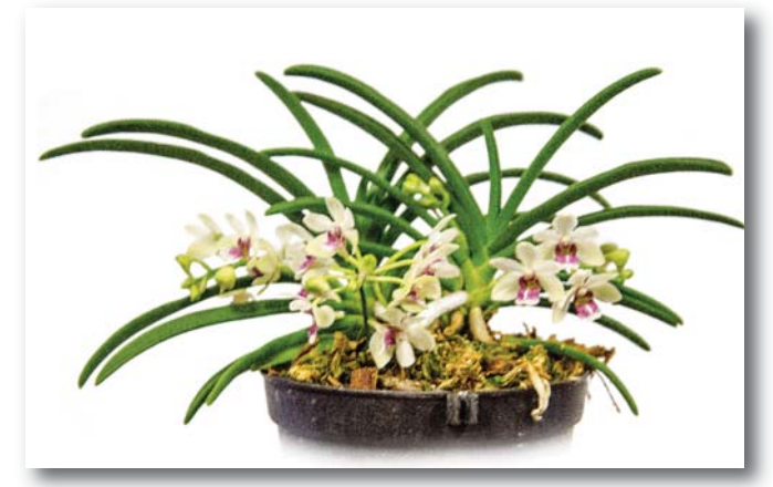
Holcoglossum flavescens x Rhy gigantea - Awarded CCC - Stan Taylor