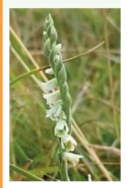
Spiranthes at Castlemorton Common