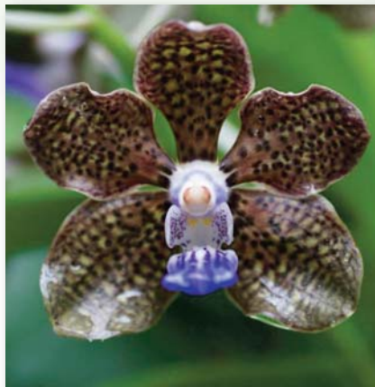
Papilionanda Mimi Palmer

At Kundasang he visited the war memorial and saw: Paphiopedilum rothschildianum - very rare and vulnerable in the wild Paphiopedilum lowii And at the De Villa Orchid Garden saw: