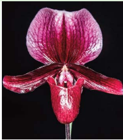
Paph. charlesworthii x Black Monarch - 29pts Malcolm Moodie