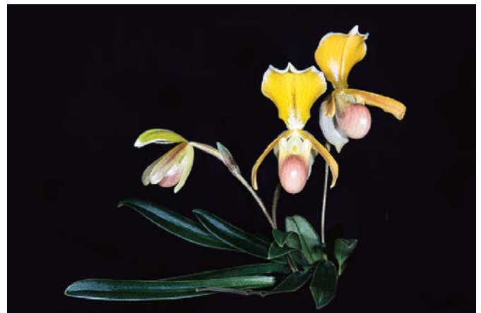
Paph. helenae - 32pts Malcolm Moodie