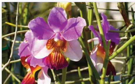
Papilionanthe Miss Joaquim "Yen"

Masses of Vanda type plants although potted, displayed discreetly as though growing in flower beds.