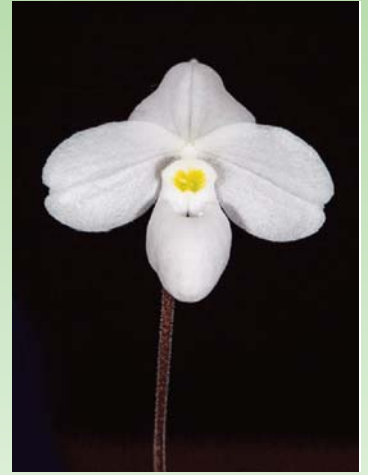
Paph. thaianum - 30pts Malcolm Moodie