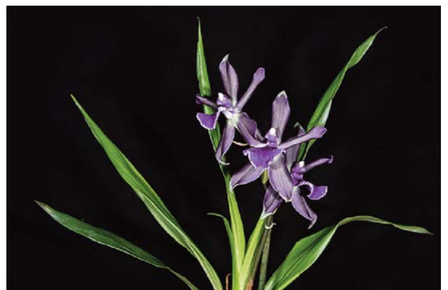
Hamelweilsara June "Indigo Sue" AM/AOS - 28pts Malcolm Moodie