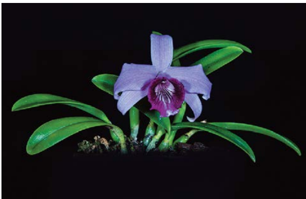
Laelia dayana - 20pts Lina Smalinske