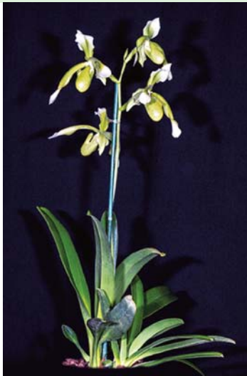
Paph. haynaldianum alba - 28pts Malcolm Moodie