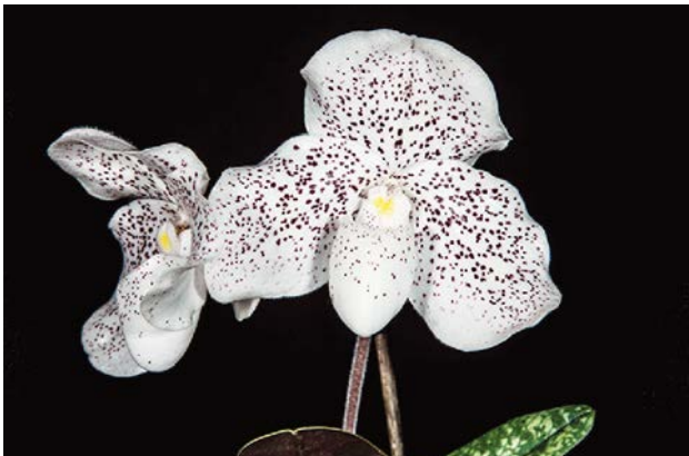
Paph. colobelle x belatulum x nivium - 32pts Lina Smalinske